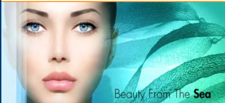
Beauty From The Sea